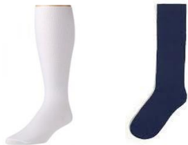
Navy or White Knee High Socks 8 th grade girls must wear White Socks on Mass Days

Plaid tie must be worn with sailor blouse. Tie is not worn with jumper.